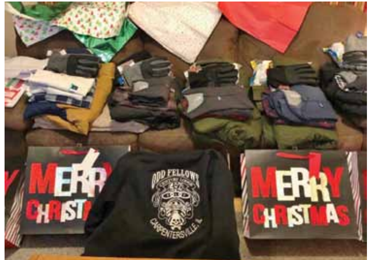
Winter Gear for Vets