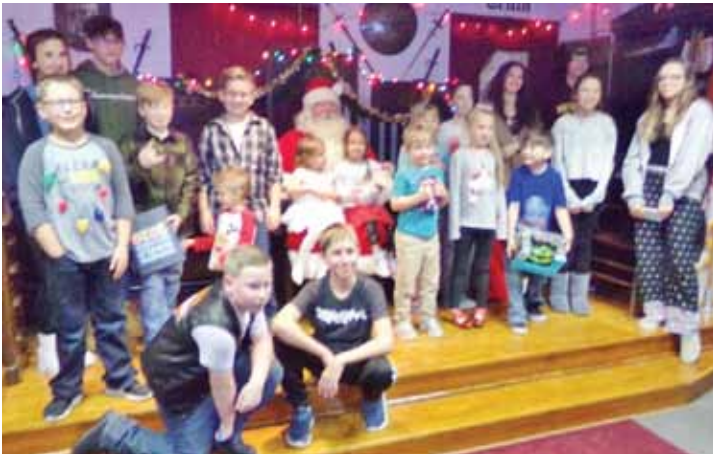
Century Lodge #492 Carpentersville held its annual Christmas Party on Saturday, December 21st. A Ham and Turkey Dinner was served. Highlight of the evening was the arrival of Santa. Pictured is all the Children with Santa. A great time was had by all members families and guests.