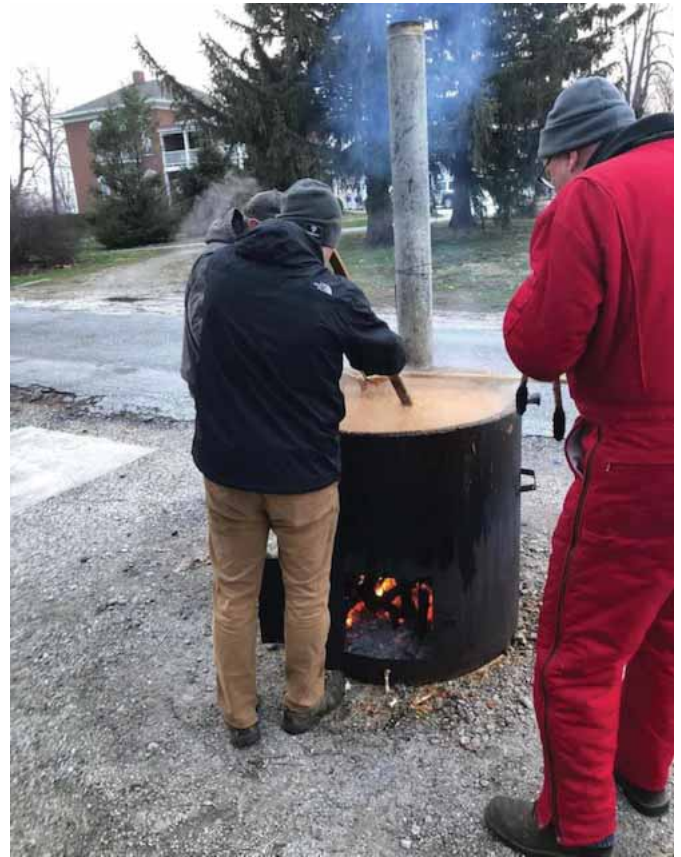
Made Burgoo soup at the park on April the 2nd at Monument Park in Winchester.